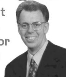
Dr. Barry Sears The Zone Diet

Millions worldwide improved their health & lost weight on Dr. Sears' Zone Diet. Now you can get your dog IN THE ZONE.